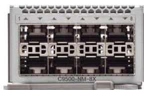
Figure 11. Cisco Catalyst 9500 Series network module 8-port 1/10 Gigabit Ethernet with SFP/SFP+

Figures 10 and 11 show the available network modules