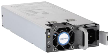
Figure 16. 650W AC power supply (C9K-PWR-650WACL-R)

Tables 9 and 10 provides more details on the Cisco Catalyst 9500X models power supplies