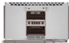
Figure 12. Cisco Catalyst 9500 Series network module 2-port 40 Gigabit Ethernet with QSFP+