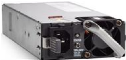
Figure 13. 950W AC power supply

Figures 13 to 16 show the power supplies available for the Cisco Catalyst 9500 Series