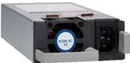
Figure 14. 650W AC power supply (C9K-PWR-650WAC-R)