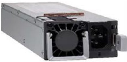
Figure 15. 1600W AC power supply