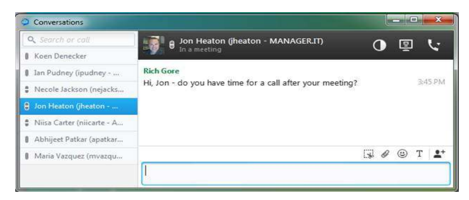
Figure 5. Starting a Voice or Video Call Means Just Clicking on the Phone Icon

With Cisco Jabber, placing and joining video calls is simple, which means more employees are gaining the communications clarity and relationship-building benefits of video. Cisco employees take advantage of the Jabber client's interoperability with Cisco video phones (9971 and 9951 models) and desktop and room-based Cisco TelePresence endpoints, and the ability to share their desktop for better information exchange and collaboration during a video call.