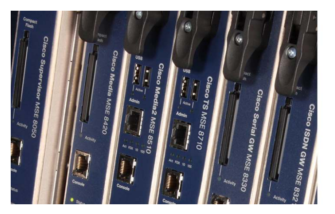
Figure 1. Cisco TelePresence MSE 8000