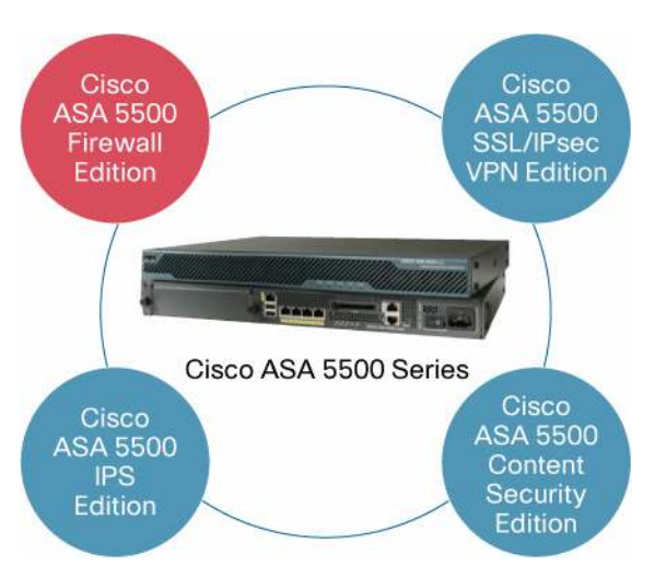
Figure 2. Complementary Solutions