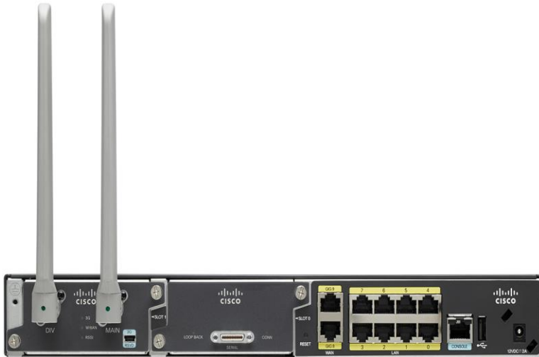
Figure 3. Cisco 800M ISR (C841M-4X) with WIM-3G and WIM-1T