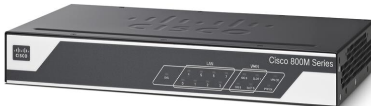
Figure 1. Cisco 800M ISR (C841M-8X)

The Cisco 800M Series platform supports pluggable Cisco WAN Interface Modules (WIMs) for flexible connectivity.